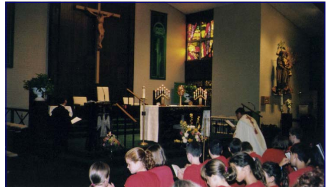
St. Catherine of Alexandria