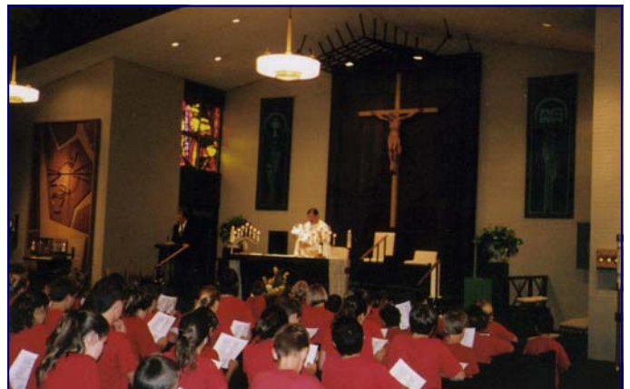
St. Catherine of Alexandria