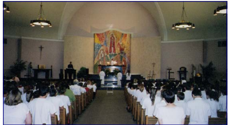
Most Holy Redeemer

“To see 900 young men and their teachers sitting in total silence in front of Our Lord, exposed in the monstrance, was beyond words,” he noted.