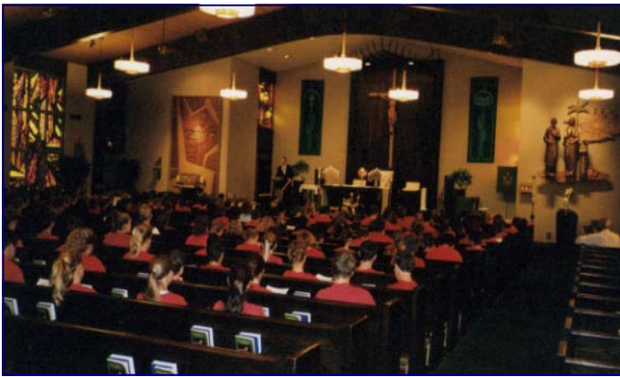
St. Catherine of Alexandria