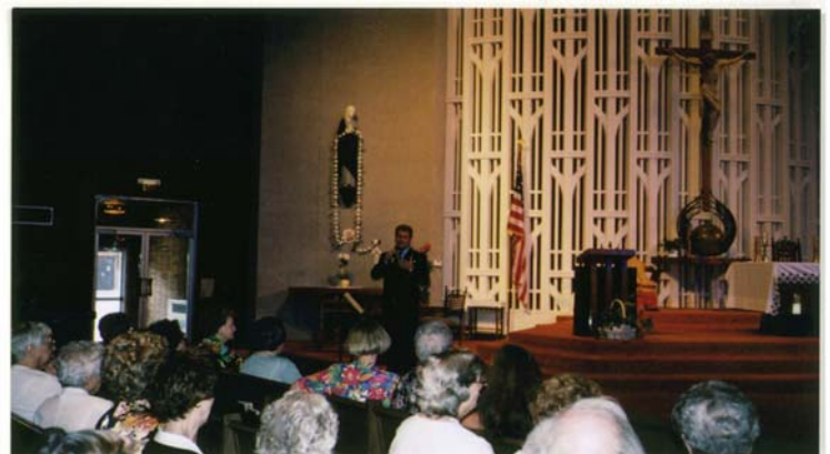
St. Francis Borgia