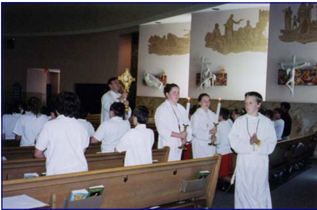
Most Holy Redeemer

There are some dates that remain open for this spring. Members of PJPII will offer their expertise to assist you in scheduling, planning and promoting this program at your parish.